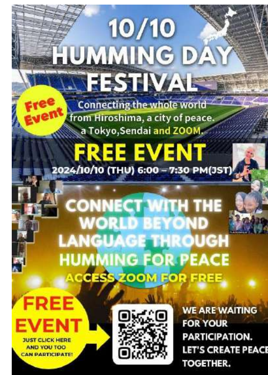
Humming Day 2024 @ Hiroshima & Online