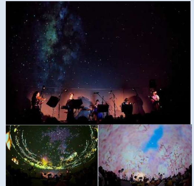
Yurakucho Marion @ Tokyo, Japan

(The Night of the Galactic Railroad Where No One Dies)