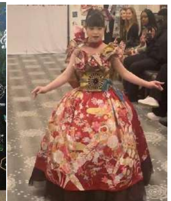
Paris Fashion Week @Paris, France