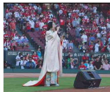
Mazda Stadium Hiroshima Carp