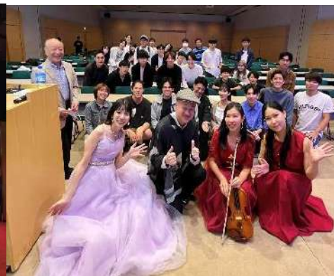
Keio University lecture @Yokohama, Japan