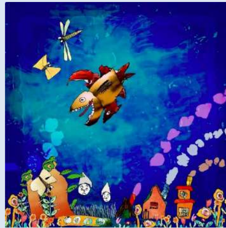
A BOY'S GAZE: 1970'S SKY