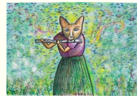
Lilia's Picture Book