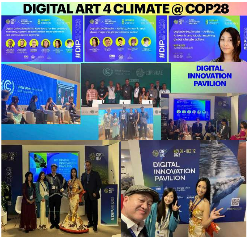
COP28@Dubai, United Arab Emirates