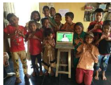
A school in India