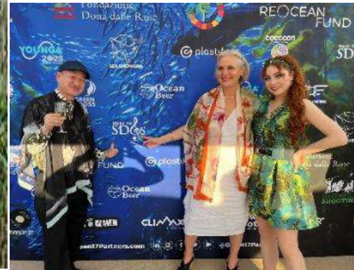
Cannes Film Festival @Cannes, France