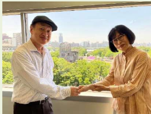
Hiroshima Film Commission