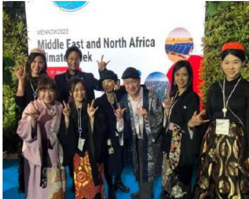
MENA Climate Week @Dubai, UAE