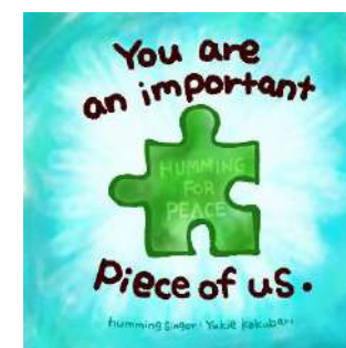
Your Piece Brings Peace to All