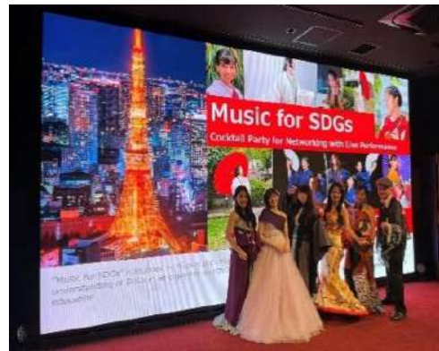
PRI in Person Reception @Tokyo, Japan