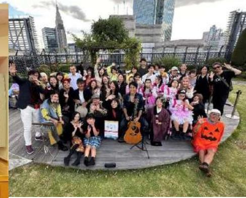
World Singing Day @Tokyo, Japan