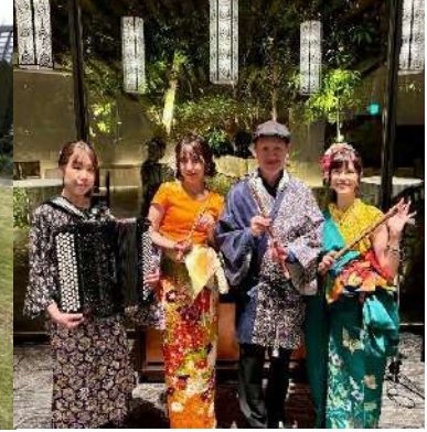
Geneva Association Associated Dinner @Kyoto, Japan