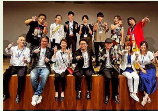
“Inside the Warmth” @ Hiroshima Screening