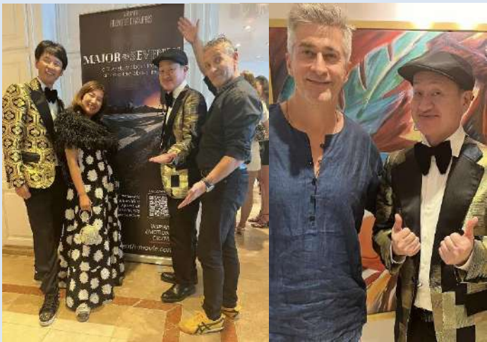
MAJOR SEVENTH @Cannes, France