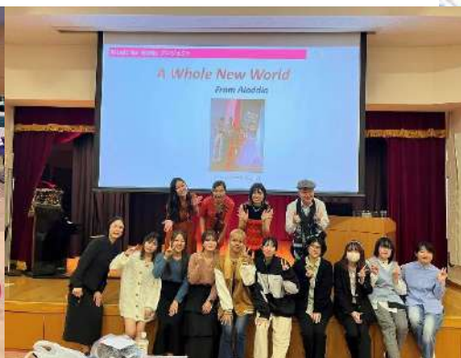
Kyoritsu Women's University lecture @Tokyo, Japan