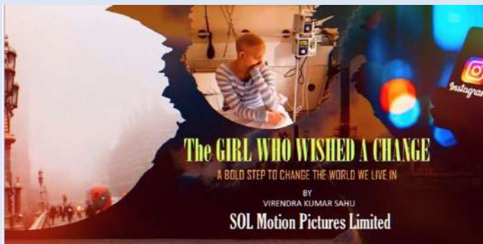
The Girl Who Wished a Change