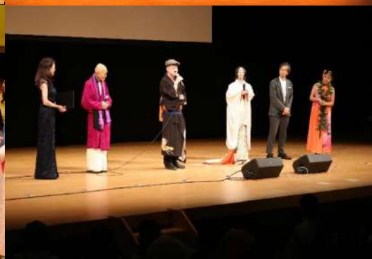
Humming Day 2023 @Hiroshima and Online