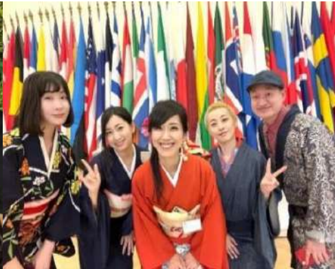
OECD Reception @Paris, France