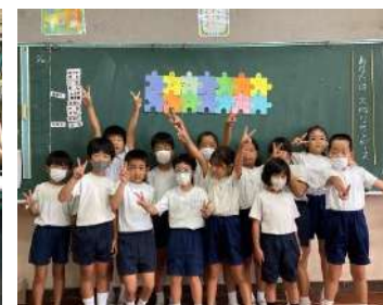
A school in Japan