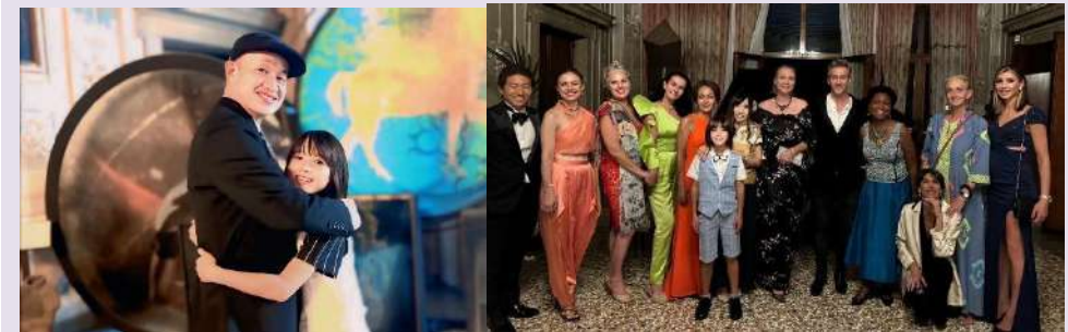
Palazzo Donà dalle Rose @Venice, Italy