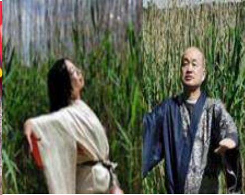
UNEP 50th Anniversary @Stockholm, Sweden